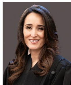
HON. VERONICA RIVAS-MOLLOY FIRST DISTRICT COURT OF APPEALS

Our panelists will explore several scenarios to which the disciplinary rule changes will apply and discuss how each ethical situation could be handled. The panelists will explain how a practitioner can use the new disciplinary rules in each scenario. They will also advise as to possible proposed rules in the pipeline.