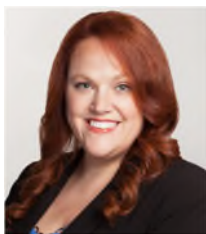
HON. MEAGAN HASSAN 14 TH COURT OF APPEALS