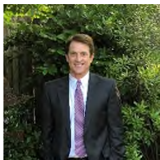
HON. RICHARD HIGHTOWER 1 ST COURT OF APPEALS