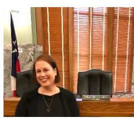
HON. SARA BETH LANDAU 1 ST COURT OF APPEALS