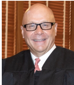
Hon. Terry Adams Chief Justice 1 st Court of Appeals