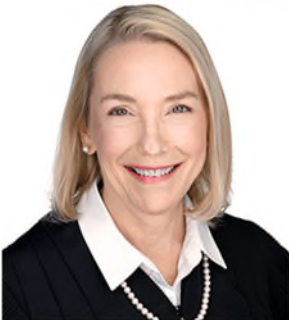
Hon. Tracy Christopher Chief Justice 14 th Court of Appeals