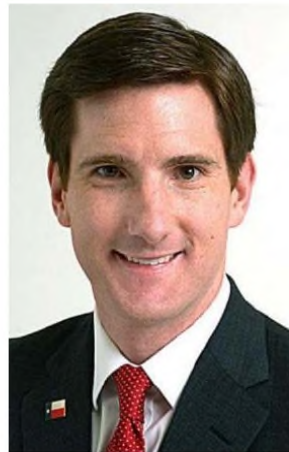
REP. BROOKS LANDGRAF TEXAS HOUSE OF REPRESENTATIVES