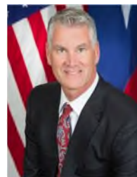
HON. DARYL MOORE 333 RD DISTRICT COURT