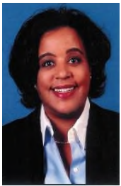
HON. URSULA HALL 165 TH DISTRICT COURT