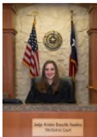
HON. KRISTEN HAWKINS 11 TH DISTRICT COURT